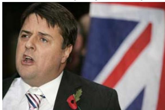
BNP Chairman Nick Griffin.

a "sad day for British politics." Arlene McCarthy, who headed the Labour list, told the crowd the BNP was "a party whose members include convicted rapists." BNP supporters replied with, "Get back to the trough!" a reference to the continuing UK parliament expenses